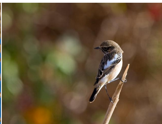
Black-crowned Night-heron - Siberian Stonechat