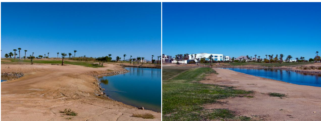
Maritim Jolie Ville golf course

The second target of the day was the golf course of Maritim Jolie Ville Golf & Resort, a luxury hotel situated 6 km NE Na'ama Bay . This was formerly named Jolie Ville Mövenpick Golf & Resort. I wanted to get acquainted with the place and ask for permission to watch and photograph birds. This is a good site for bird watching, especially during migration. If you keep an eye open for golf balls and are careful not to get in the way of the golfers, then you are welcome to move around freely here.