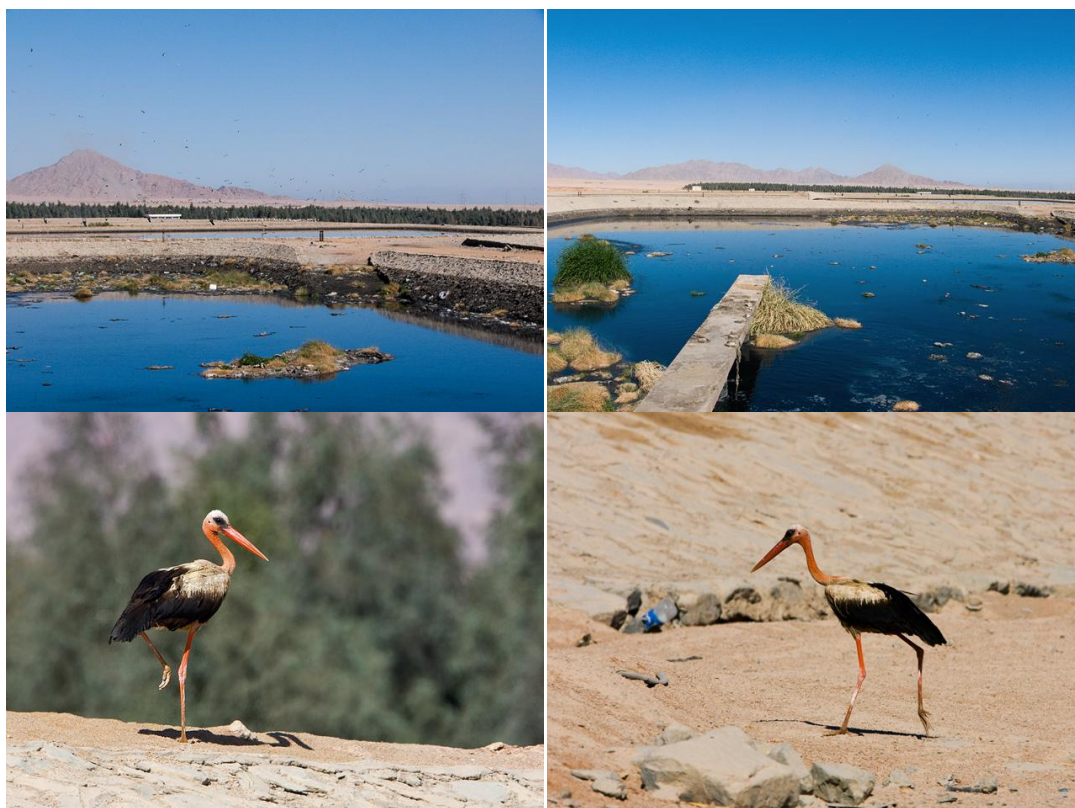
Views from the sewage ponds and a not very healthy White Stork