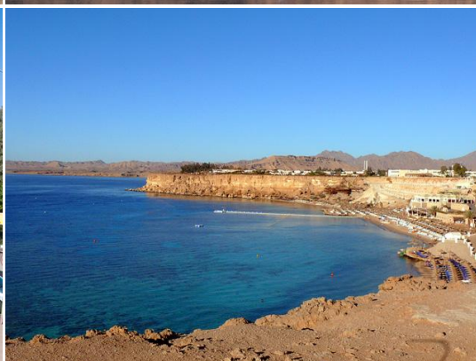
Towel art - View from Na'ama Bay sewage ponds - Old Market - Ras Um Sid