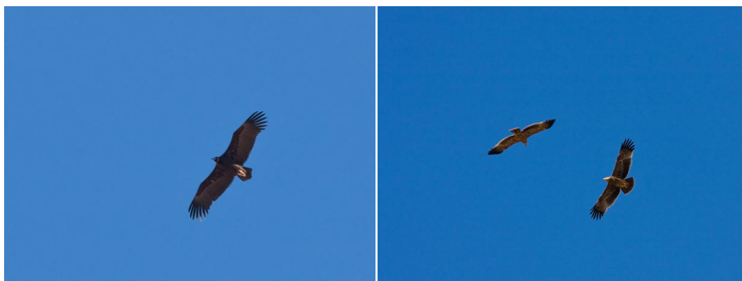
Eurasian Black Vulture - Eastern Imperial Eagles