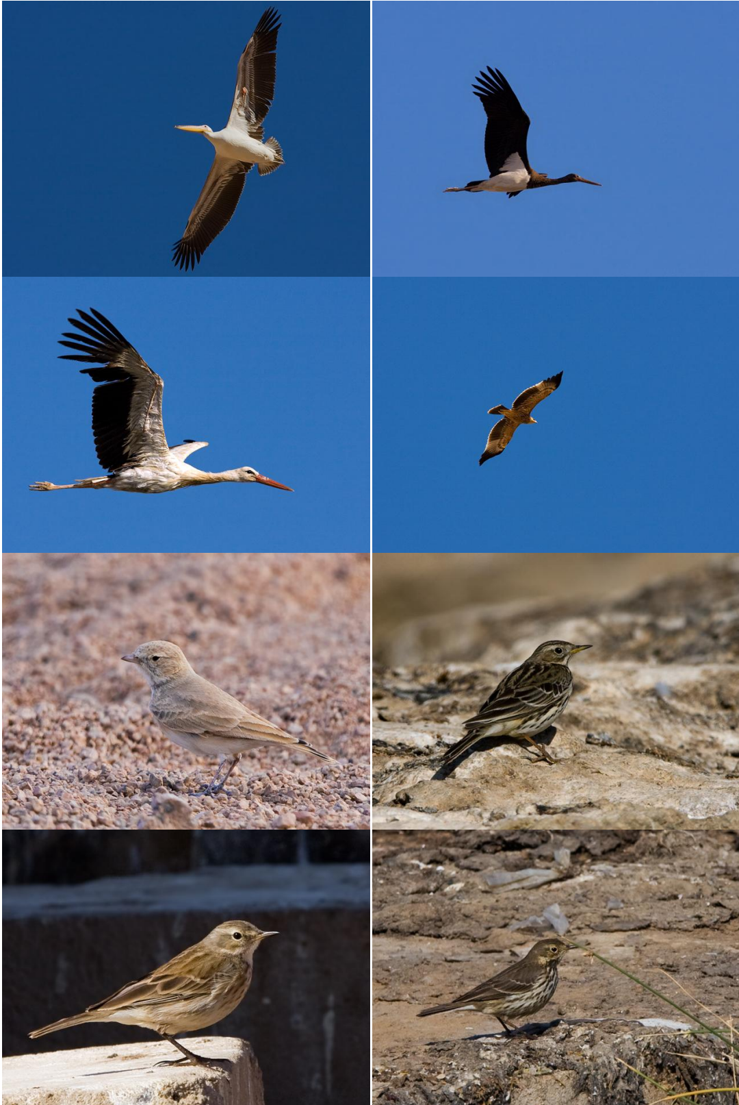
Great White Pelican - Black Stork - White Stork - Eastern Imperial Eagle - Bar-tailed Lark - Red-throated Pipit - Water Pipit - Buff-bellied Pipit