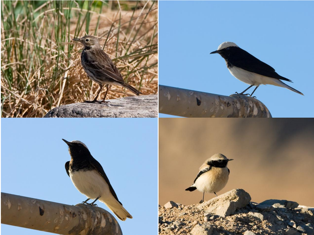
Buff-bellied Pipit - Hooded Wheatear - Desert Wheatear

The second target of the day was the golf course of Maritim Jolie Ville Golf & Resort, a luxury hotel situated 6 km NE Na'ama Bay . This was formerly named Jolie Ville Mövenpick Golf & Resort. I wanted to get acquainted with the place and ask for permission to watch and photograph birds. This is a good site for bird watching, especially during migration. If you keep an eye open for golf balls and are careful not to get in the way of the golfers, then you are welcome to move around freely here.