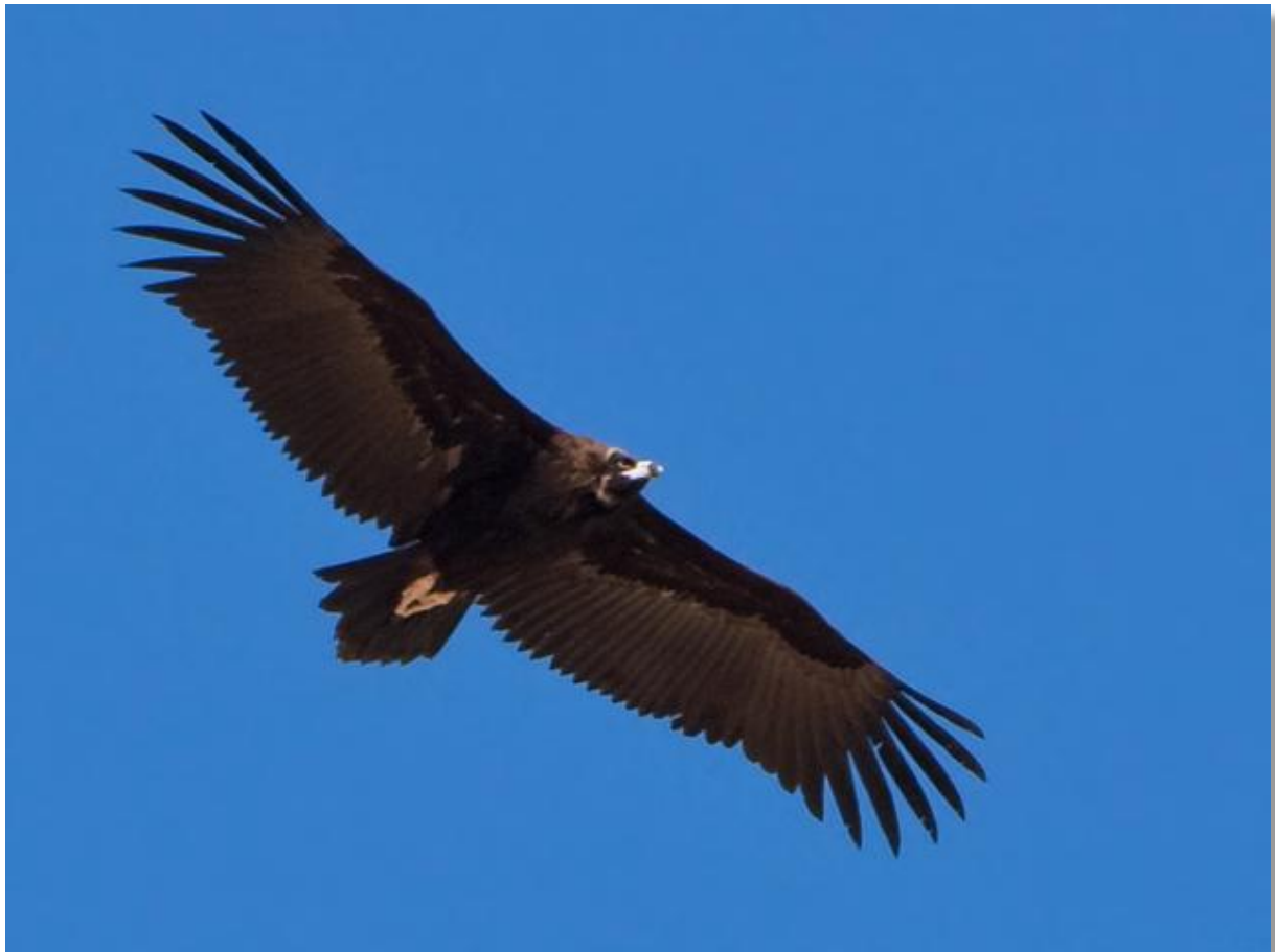
Eurasian Black Vulture, Na'ama Bay sewage ponds, 6 Jan 2009