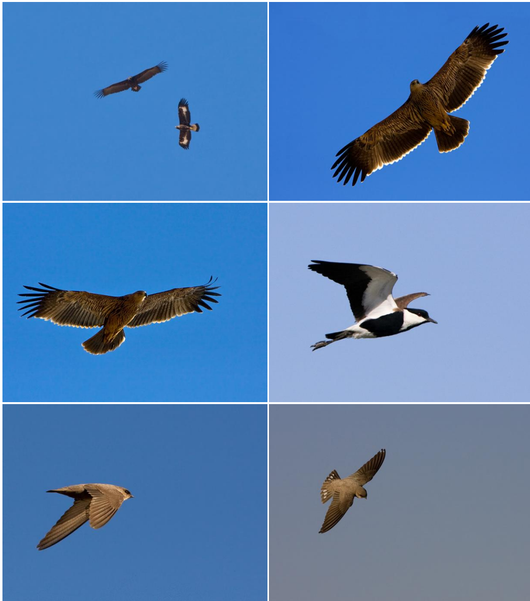
Eurasian Black Vulture & Golden Eagle - Eastern Imperial Eagles - Spur-winged Lapwing - Pale Crag Martins