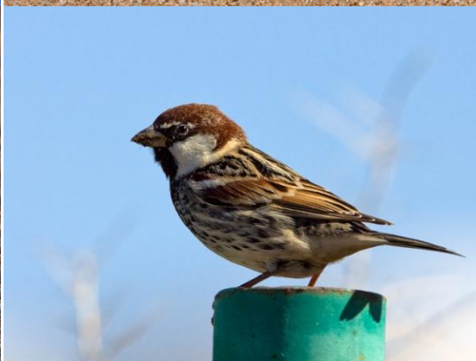
Common Kestrel - Laughing Dove - Bluethroat - Spanish Sparrow