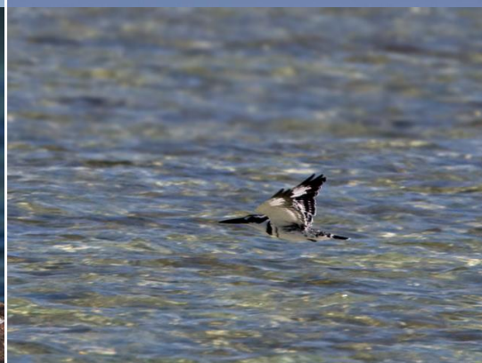
Western Reef Egret - Osprey - Greater Sand Plover - Sooty Gulls - Caspian Terns - Pied Kingfisher